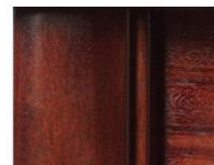
Red/Brown Solid Timber