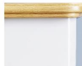
Painted with Oak Mantel